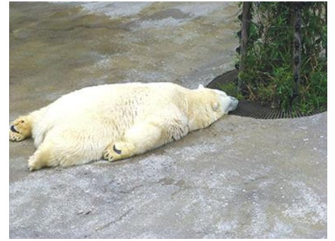
Asahiyama Zoo 旭山動物園

Visit the Kitami Fox Farm . This unique attraction allows visitors to observe and learn about the Ezo red fox, a species native to Hokkaido.