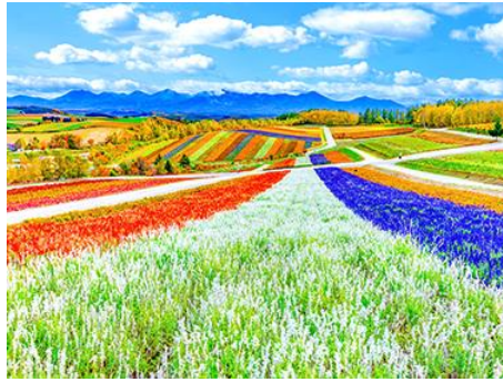
Shikisai no Oka 四季彩之丘