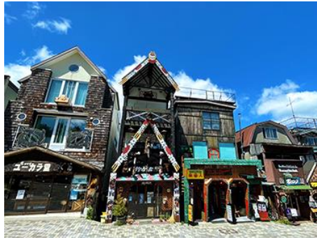
Lake Akan Ainu Kotan 阿寒湖愛努古丹