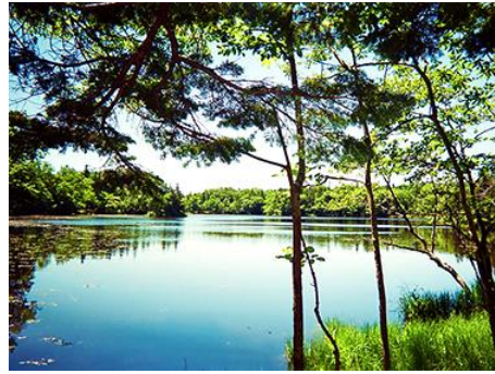
Shiretoko Goko 知床湖五湖