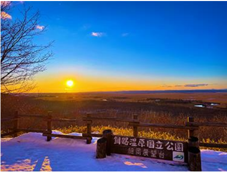
Kushiro Marsh 釧路湿原