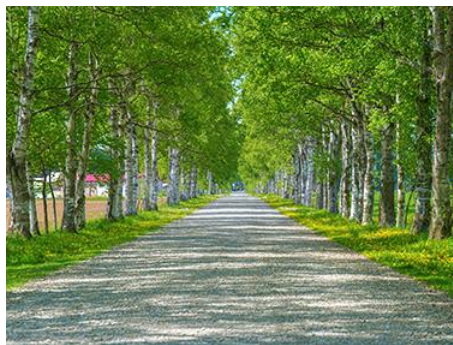
Tokachi Ranch Birch Avenue 十勝農場白樺樹