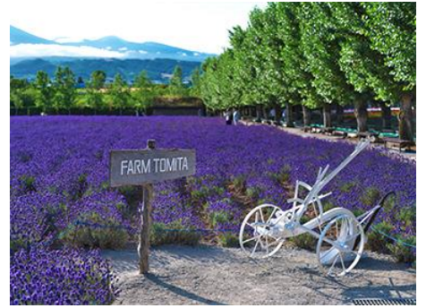
Farm Tomita 富良野/富田農場

Begin your day with a visit to the mesmerizing Blue Pond in Biei . Known for its otherworldly turquoise waters, the Blue Pond gets its unique color from natural minerals dissolved in the water.