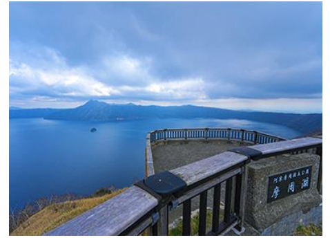
Kamui Terrace 摩週湖神威露台

Begin the day with a visit to Kushiro Marsh , Japan's largest wetland. The Onnenai Boardwalk offers an accessible and immersive way to experience this unique ecosystem.