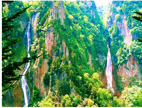
Ginga and Ryusei Waterfalls 銀河/流星墜落