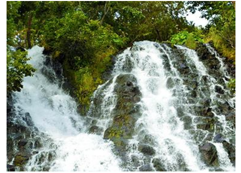
Oshinkoshin Falls 阿新科申瀑布

Begin your day with an exhilarating Shiretoko Cruise . These boat tours offer a unique perspective of the Shiretoko Peninsula's dramatic coastline, teeming with wildlife and stunning cliffs.