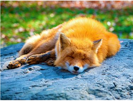
Kitami Fox Farm 北狐農場