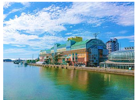
Kushiro Fisherman's Wharf MOO 釧路漁人碼頭 MOO

After arriving at Sapporo or New Chitose Airport, we will head straight to Kushiro , a city known for its stunning natural beauty and rich cultural heritage. Our first stop on the way to Kushiro is the Tokachi Ranch Birch Avenue . This picturesque avenue is lined with beautiful white birch trees, creating a serene and enchanting atmosphere.