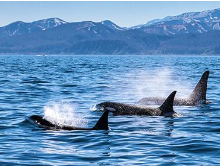
Shiretoko Cruise 知床遊船