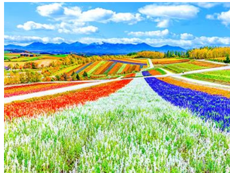
Shikisai no Oka 四季彩之丘