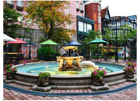
Shiroi Koibito Park 白色戀人公園

Explore some of Sapporo's most iconic and culturally significant sites :