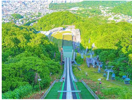
Okurayama Ski Jump Stadium 大倉山跳躍體育場