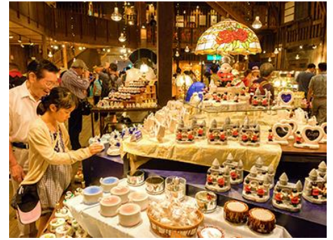
Otaru Music Box Museum 漫步小樽坂町大道

Begin the day with a visit to Asahiyama Zoo , one of Japan's most popular and innovative zoos. From the underwater glass tunnel in the penguin exhibit to the seal dome where seals swim above you, every corner of the zoo offers a unique and engaging experience.