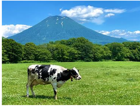
Niseko Takahashi Dairy Farm 新雪谷高橋農場