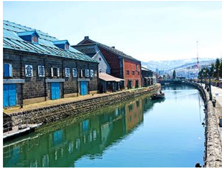
Otaru Canal 小樽運河