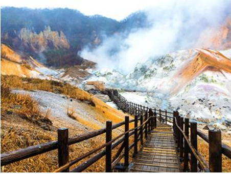
Noboribetsu Jigokudani 登別地獄谷