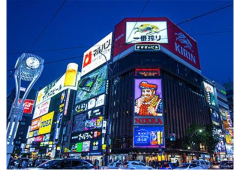
Sapporo City 札幌市

Stop at Noboribetsu Jigokudani , also known as Hell Valley. This dramatic volcanic valley is famous for its steaming vents, sulfurous streams, and other geothermal activity, witness the raw power of nature up close, with bubbling hot springs and vibrant mineral deposits creating a surreal landscape.