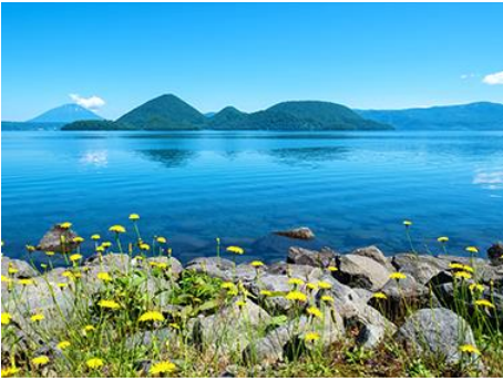
Lake Toya 洞爺湖