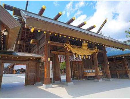
Hokkaido Shrine 北海道神宮