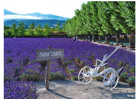
Farm Tomita 富良野/富田農場

Arrive at New Chitose Airport , embark on a journey through some of Hokkaido's most stunning landscapes, starting with Furano, moving on to Biei, and concluding the day in Asahikawa.