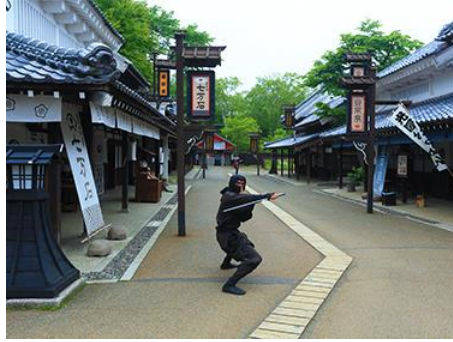
Date Jidaimura 伊達時代村