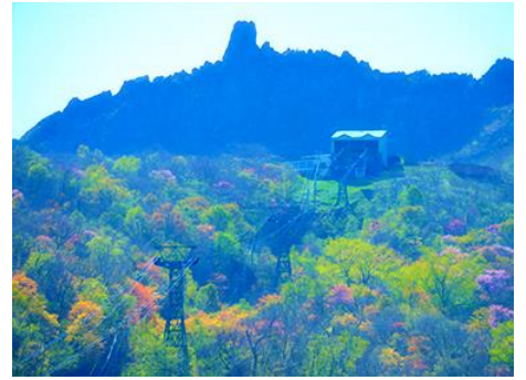
Usuzan Ropeway & Terrace. 白山索道 白山露台

First, stop at the charming Niseko Takahashi Dairy Farm . This delightful farm is famous for its high-quality dairy products, including fresh milk, cheeses, and ice cream.