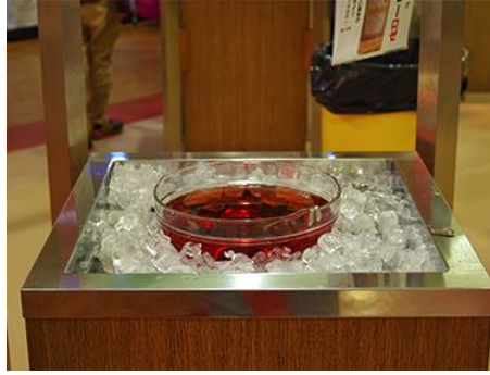
Shimane Winery – Tasting wine 島根醸酒廠 - 品酒