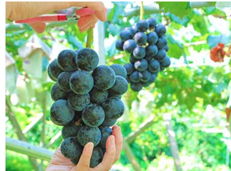
Seasonal fruit picking 當季水果採摘體驗

On Day 6, begin with a visit to Korakuen Garden , one of Japan's three most beautiful landscape gardens , known for its elegant design and seasonal beauty. After enjoying the tranquil scenery, partake in a seasonal fruit-picking experience , where you can enjoy fresh, locally grown fruits. transfer to Osaka city or Kansai Airport ,