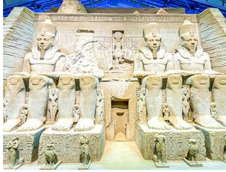
The Sand Museum 砂之美術館