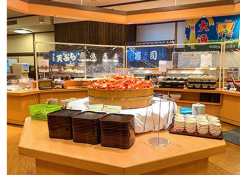
Buffet at the hotel 飯店自助餐

Meet up and pickup at Osaka city or Kansai Airport. Begin your adventure with a visit to the Tottori Sand Dunes , a natural wonder that stretches along the coast, offering stunning views and unique sand formations.