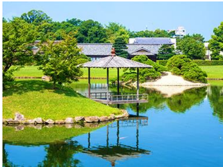
Korakuen Garden 後樂園