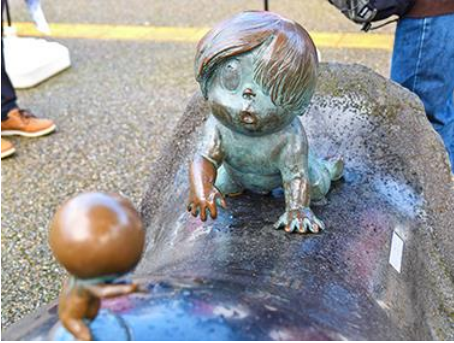
Mizuki Shigeru Road 水木茂路