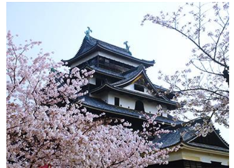
Matsue Castle 松江城

Begin your day with a visit to Mizuki Shigeru Road , a whimsical street dedicated to the famous manga artist Mizuki Shigeru, known for his work on the GeGeGe no Kitaro series . The street is lined with bronze statues of his characters and offers a delightful, immersive experience into his imaginative world. Next, experience the Eshima Ohashi Bridge , famously known as the " Roller Coaster Bridge " due to its steep gradient, offering a thrilling drive and spectacular views.