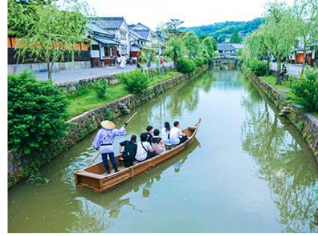
Kurashiki Bikan Historical Quarter 倉敷美観地区

On Day 5, start with a round-trip ferry ride from Miyajimaguchi to Miyajima , offering beautiful views of the Seto Inland Sea. Upon arriving on Miyajima, visit the iconic Itsukushima Shrine , renowned for its " floating " torii gate and serene beauty. This UNESCO World Heritage Site provides a deep sense of Japan's historical and cultural heritage.