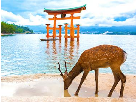
Miyajima (Itsukushima Shrine) 宮島（厳島神社）