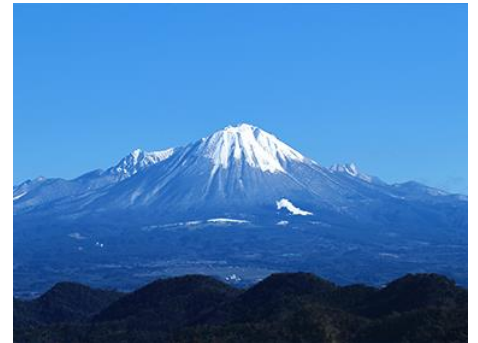
Mt. Daisen 大山山

Day 2, explore the Kurayoshi Shirakabe Dozo District , where traditional white-walled warehouses and historic buildings line the charming streets, offering a glimpse into Japan's Edo period architecture. Visit the Kankyo Shuuzo Sake Brewery , where you can learn about the intricate process of sake brewing and enjoy tastings of their finest selections.