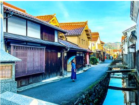
Kurayoshi Shirakabe Dozo District 倉吉白牆倉庫群