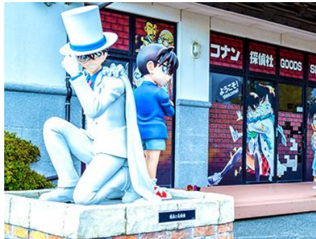
Aoyama Goshō Furusato 青山剛昌故郷