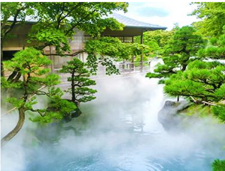
Yushien Garden 由志園