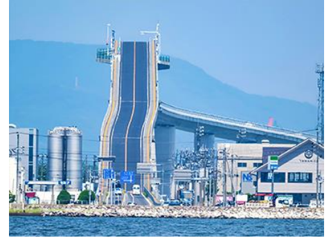
Roller Coaster Bridge 江島大橋(雲霄飛車橋)