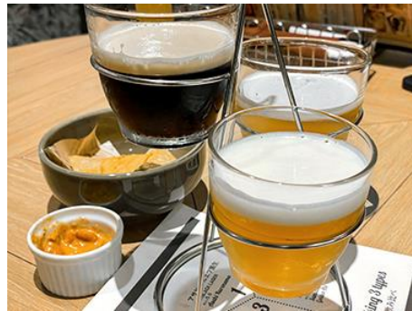
Matsue Beer Hall 松江當地啤酒館