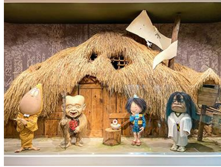
Mizuki Shigeru Road 水木茂路