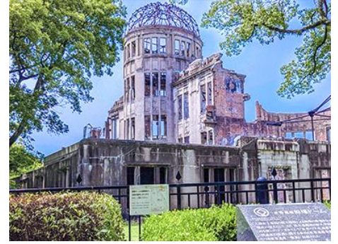
Atomic Bomb Dome 原子彈爆炸圓頂屋

On Day 4, visit Izumo Taisha , one of Japan's oldest and most important Shinto shrines, renowned for its grand architecture and deep spiritual significance. After exploring the shrine, head to the Shimane Winery , where you can tour the winery facilities, learn about the wine-making process, and sample some of the finest local wines .