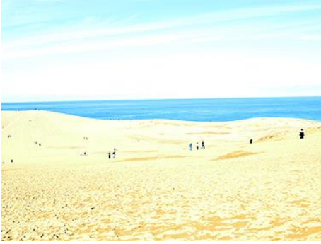
Tottori Sand Dunes 鳥取沙丘