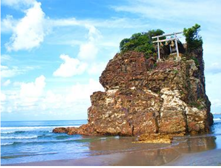
Izumo Taisha Shrine 出雲大社