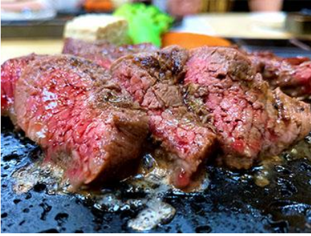
Hida Beef 飛段牛