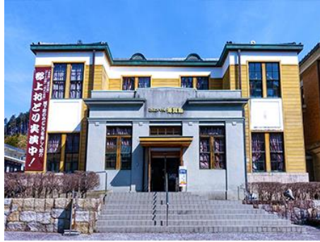
Gujo Hachiman Museum 郡上八幡博覧館