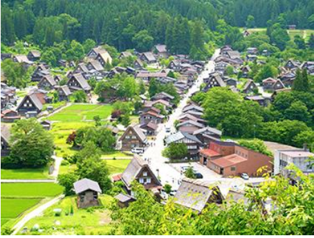
Shirakawa-go Village 白川郷合掌造村