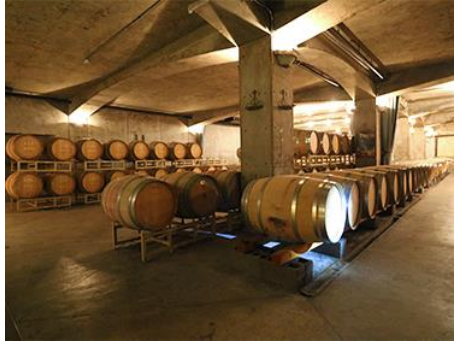
Yamanashi Winery 山梨醸酒廠