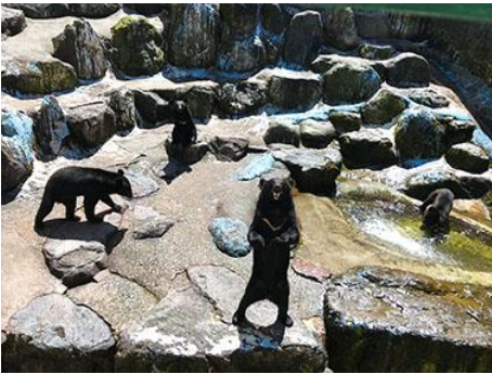
Oku-Hida Bear Ranch 奥飛騨熊牧場