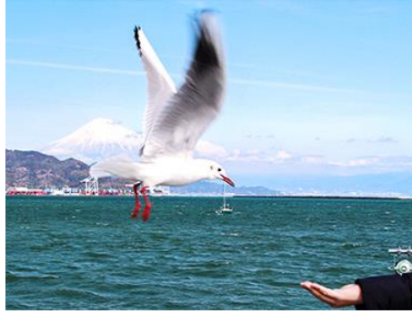
Suruga Bay Ferry 駿河湾渡輪