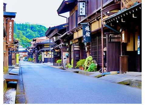
Takayama Old Townscape 高山老街

Nestled in the picturesque mountains of Gifu Prefecture, Shirakawa-go Gassho-style Village offers a glimpse into traditional Japanese rural life with its iconic thatched-roof houses. Among these, the Wada House stands out as a nationally designated important cultural property, showcasing the unique architectural style and historical significance of the Gassho-zukuri structures .