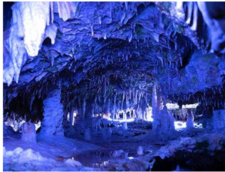
Hida Great Limestone Cave 飛騨大石灰岩洞窟