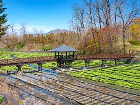
Azumino Daio Wasabi Farm 安曇野王芥末農場