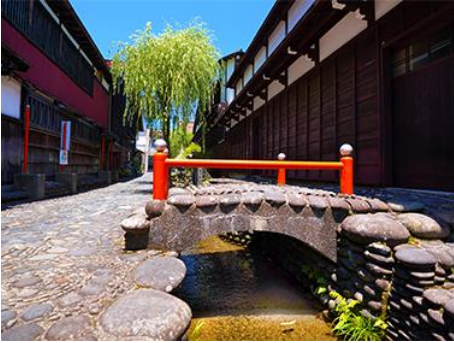
Gujo Hachiman Castle Town 郡上八幡城下町