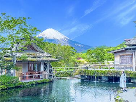
Oshino Hakkai 忍野八海