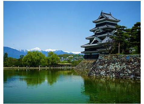
Matsumoto Castle 松本城

On Day 3, the Shinhotaka Ropeway offers an exhilarating ascent from Shinhotaka Onsen Station to Nabejira Kogen Station, continuing from Shirakaba-daira Station to Nishihotakaguchi Station. This unique double-decker gondola ride provides breathtaking panoramic views of the Northern Japan Alps .