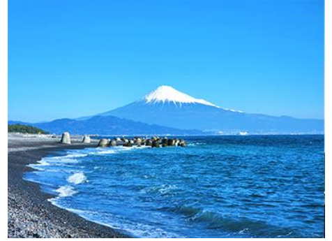
Miho no Matsubara 三保松原

On Day 6, take a trip to Shuzenji Temple , located at the heart of a charming onsen town in the Izu Peninsula . This area is renowned for its historic temples, serene bamboo groves, and rejuvenating hot springs. Nearby, Joren Falls cascades gracefully into a lush forest setting, offering a tranquil escape and a glimpse of nature's beauty.