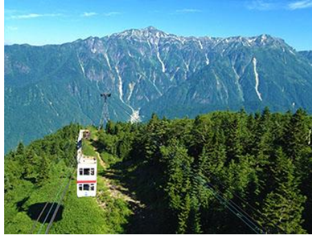
Shinhotaka Ropeway 新穂高纜車