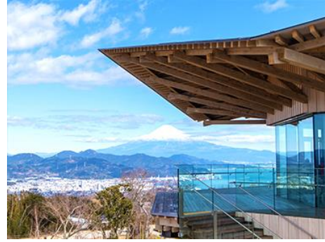
Nihondaira Dream Terrace 日本平夢露台

Last day is for discover new sightseeing place, such as Kunozan Toshogu Shrine , perched on Mount Kunozan, is a beautifully ornate shrine dedicated to Tokugawa, the founder of the Tokugawa shogunate. Accessible by a scenic cable car ride, it offers not only historical insights but also stunning views of Suruga Bay. Nearby, the Nihondaira Dream Terrace provides a panoramic vista of Mount Fuji, the Southern Alps, and the Pacific Ocean , making it a perfect spot for breathtaking photographs and leisurely walks.