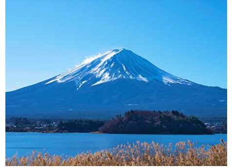
Kawaguchiko Oishi Park 河口湖 大石公園

On Day 4, start by visiting Azumino Daio Wasabi Farm , located in the serene countryside of Nagano. As one of Japan's largest wasabi farms, it offers visitors a chance to stroll through its picturesque fields and enjoy fresh wasabi products . After exploring the farm, leave Nagano and head to Yamanashi Prefecture.