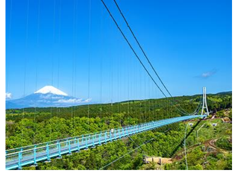
Mishima Skywalk 三島天空歩道

Continuing our trip around Mt. Fuji, we start the day by visiting Oshino Hakkai , a scenic village located between Lake Kawaguchi and Lake Yamanaka. This charming village is famous for its eight crystal-clear ponds , fed by the snowmelt from Mount Fuji. After exploring Oshino Hakkai, we say goodbye to Yamanashi and transfer to the Hakone area.