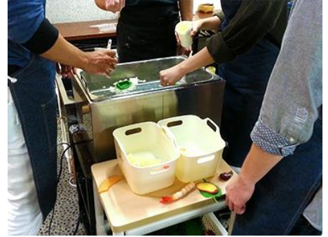
Food Replica Workshop 食品様品工作坊

After meeting and pickup in Osaka city or at Kansai Airport, the trip begins with a stroll around the retro town of Gujo Hachiman Castle . In the Edo period, Gujo Hachiman was a town for the common people, featuring rows of houses ranging from small craftsmen's homes to large merchants' residences. Even today, you can see traces of this era all along the streets.