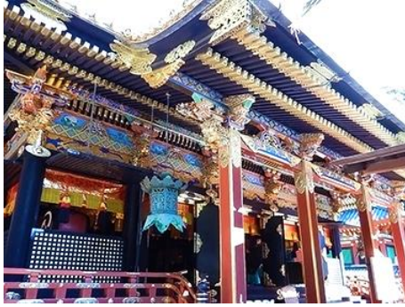
Kunozan Toshogu Shrine 久能山東照宮