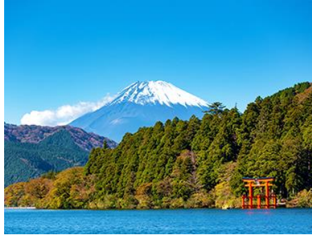
Hakone Pirate Ship 箱根海賊船