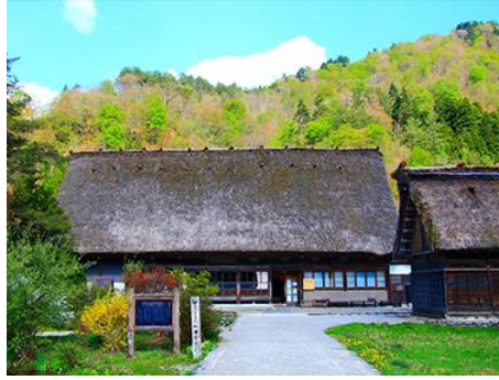
Wada House 和田家