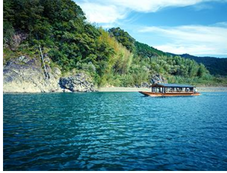
Shimanto River Cruise 四万十川観光遊覧船