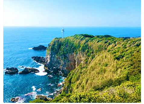
Cape Ashizuri 足折岬

For a journey back in time, Uchiko Town is a must-visit. With townscapes preserved since the Edo period , it offers a unique blend of history and magnificent nature.