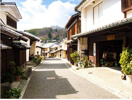
Uchiko Town 内子街景