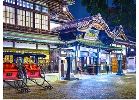
Dogo Onsen 道後温泉

The day starts with a visit to Matsuyama Castle , accessible by cable car or lift. Recognized as one of Japan's 100 Famous Castles and one of Japan's 100 Beautiful Historical Landscapes , it offers a breathtaking view that can appear as if floating on a sea of clouds, weather permitting.