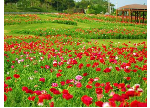
Akashi Kaikyo National Government Park

The last day of our trip promises a stunning adventure with visits to the Naruto Whirlpools and Akashi Kaikyo National Government Park .