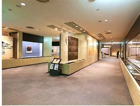
Shiki Memorial Museum 志木記念館