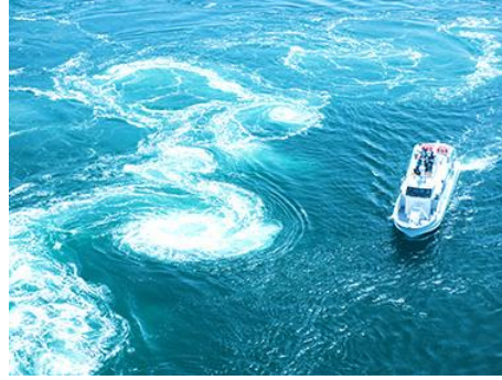
Naruto Whirlpools Cruise 鳴門漩渦潮汐船