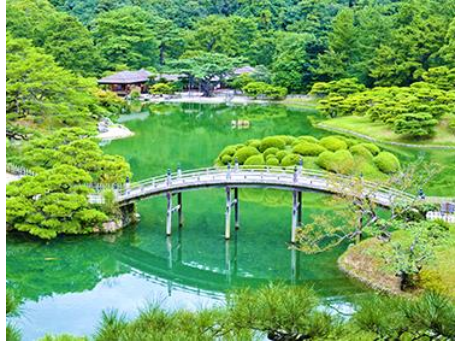
Ritsurin Garden 栗林公園