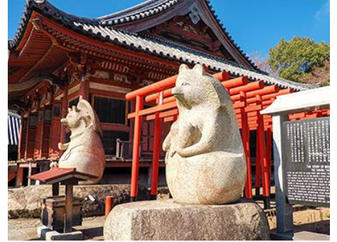
Yashima-ji Temple 屋島寺

Pick up at Kansai Airport or Osaka city, then head to Kagawa Prefecture via the Akashi Kaikyo Bridge . Known as the “ Udon Prefecture ,” Kagawa offers a unique taste of its famous udon. Experience local handmade culture with an udon-making class and enjoy lunch with the freshly made udon.