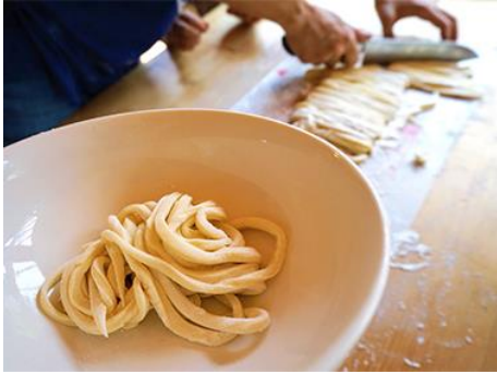
Udon-making class 烏龍麵製作體驗