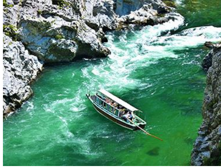
Oboke Gorge Boat 大歩危峡谷遊船