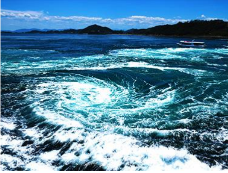
Naruto Whirlpools 鳴門漩渦