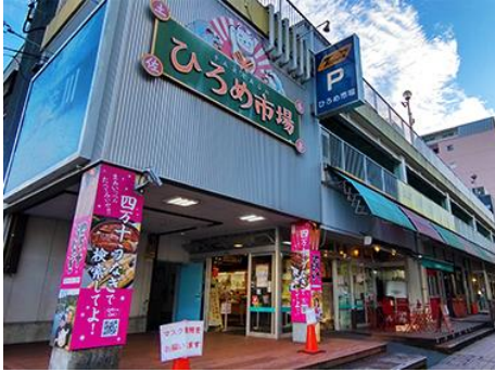
Hirome Market 弘人市場