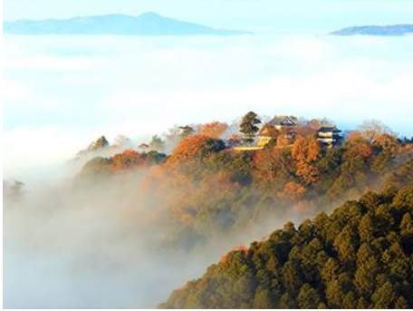
Matsuyama Castle 松山城