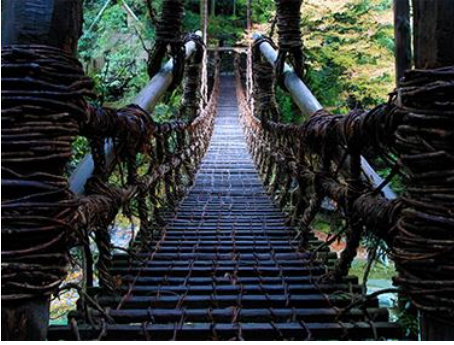
Iya Kazura Bridge 祖谷葛橋