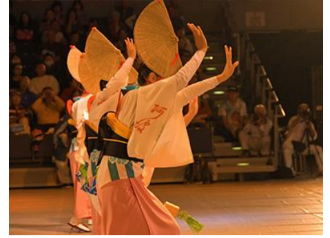
Awa Odori Performance 阿波舞表演

On Day 5, visit Iya Kazura Bridge , one of Japan's 3 rare bridges . Made of vines weighing about 5 tons and replaced every three years, it offers a unique and thrilling experience.