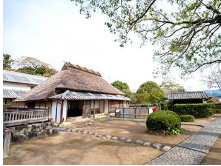
Birthplace of Iwasaki Yataro 岩崎彌太郎出生地