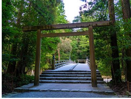
Ise Jingu Shrine Geku 伊勢神宮外宮