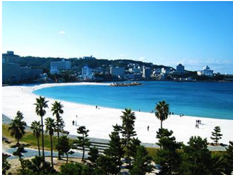
Shirahama Beach 白良濱