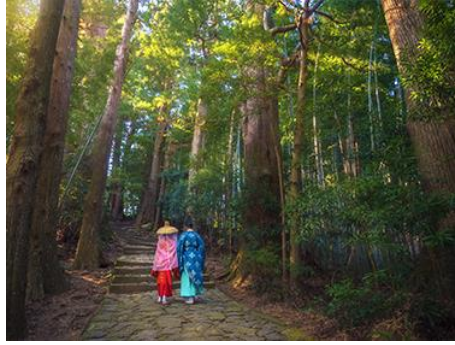
Kumano Kodo – Daimonzaka 熊野古道-大門坂