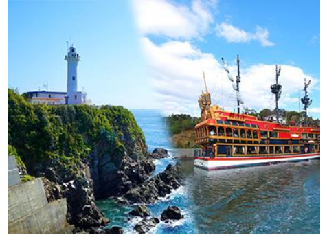
Ago Bay Cruise & Daio Lighthouse 英虞灣遊船&大王燈塔

Our second day begins with a visit to Mikimoto Pearl Island , located in Toba Bay, Mie Prefecture, where Kokichi Mikimoto first cultivated pearls in 1893. Initially for dignitaries and media, it opened to the public in 1951, showcasing pearl farming and female divers , and has since welcomed over 51 million visitors from Japan and abroad.