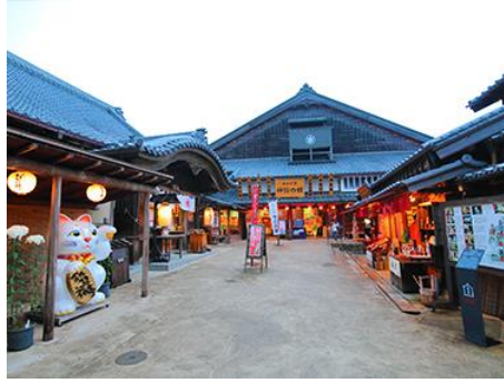
Okage Yokocho 禦影横丁