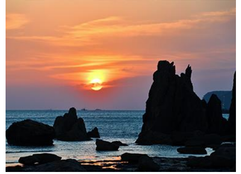
Hashiguiiwa Rock 橋奎岩

This day is called “Pilgrimage Day” as we visit five of the most sacred sites of the World Heritage “Kumano Kodo trail” : Kumano Hongu Taisha Shrine , Kumano Kodo – Daimonzaka , Kumano Nachi Taisha Shrine , Seiganto-ji Temple , and Nachi Falls . Immerse your soul in the serene atmosphere, wishing for a lucky and successful life.