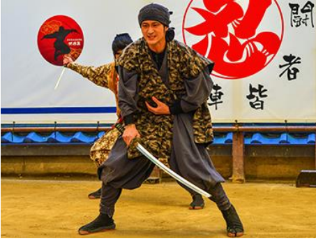
Iga Ninja Museum 伊賀流忍者博物館