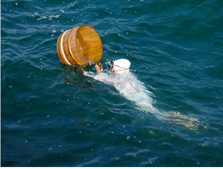
Mikimoto Pearl Island 御本木珍珠島