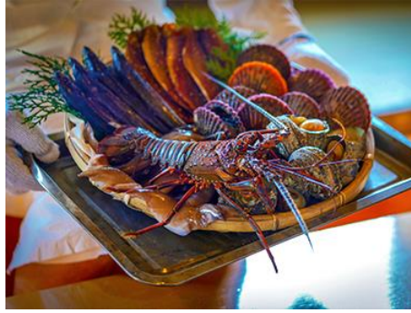
Seafood BBQ 海鮮燒烤午餐