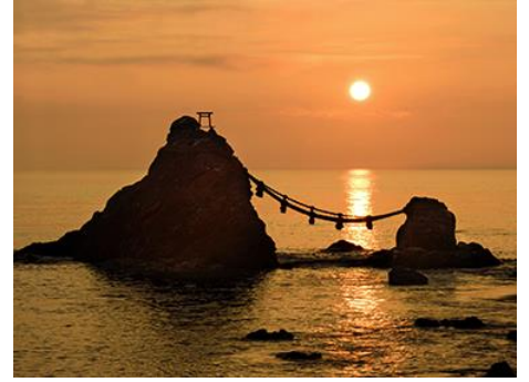
Married Couple Rocks 夫婦岩

Transport to Iga city in Mie Prefecture, known as the hometown of Ninja before they spread throughout ancient Japan. In Iga, we will visit the Iga Ninja Museum , where you can see and hear fascinating stories about Ninja and Ninjutsu. You also have the opportunity to rent and experience Ninja cosplay (self-payment). Additionally, a Ninja show is a must-see part of this sightseeing tour, featuring real Ninja performing their legendary Ninjutsu right in front of you, with a chance to take photos with them (self-payment).