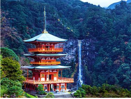
Seiganto-ji Temple & Nachi Falls 青岸渡寺&那智瀑布