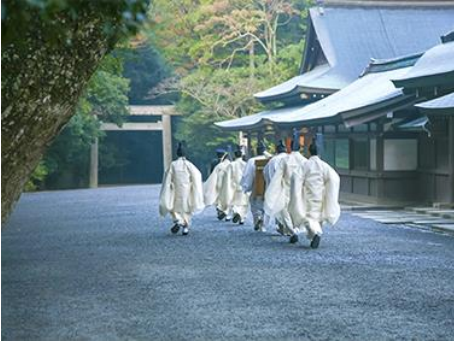
Ise Grand Shrine Naiku 伊勢神宮内宮