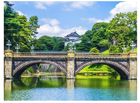
Imperial Palace 皇居