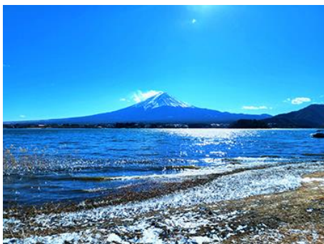
Lake Kawaguchiko & Oishi park 河口湖及大石公園