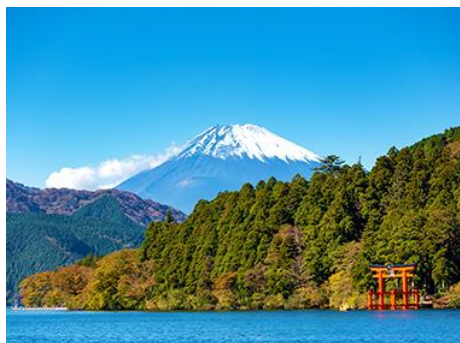
Ashinoko Lake & Hakone Shrine 蘆之湖和箱根神社