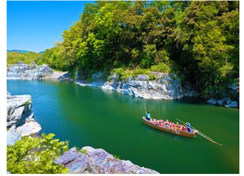
Nagatoro Line Boat Ride 長瀬線乗船遊覧

On this day, we make a trip to discover the old town of Japan, Little Edo Kawagoe , followed by rafting on the Arakawa River , and a visit to a traditional Japanese sake brewery .