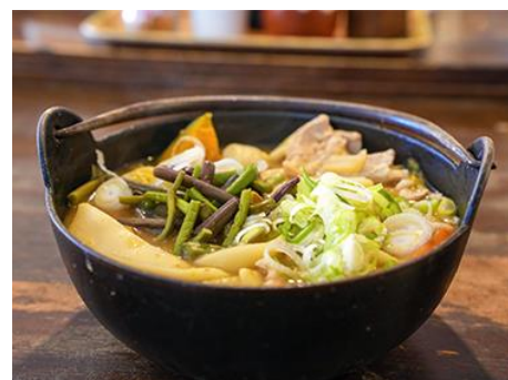
Hōtō Nabe hotpot 鱧鍋

Start your day in Hakone with a visit to Ashinoko Lake , Hakone Shrine and Owakudani .