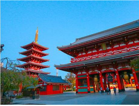
Sensoji Temple 浅草寺