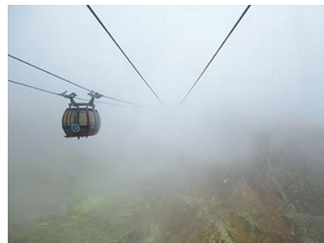
Cable car to Owakudani 前往大涌谷的纜車