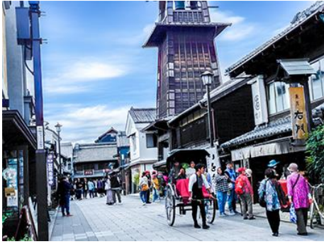
Little Edo - Time Bell Tower 小江戸川越 - 時間鐘樓