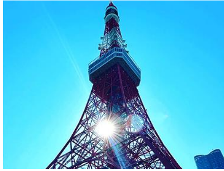
Tokyo Tower 東京鐵