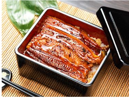
Eel Rice 鰻魚重