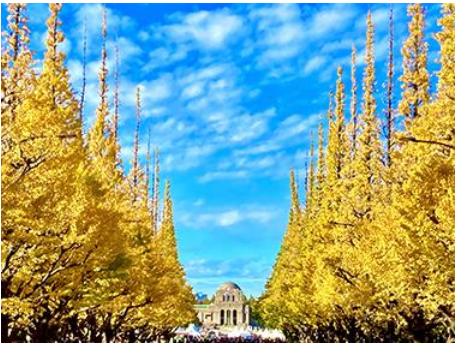
Meiji Jingu Outer Garden 明治神宮外苑