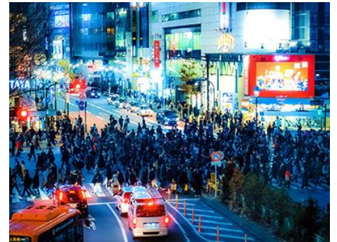
Shibuya Scramble 澀谷爭奪戰

Arrive at Narita International Airport between 6:00 - 7:30 AM . After going through immigration procedures, your tour guide will welcome the group at the arrival gate. From there, board the bus to Tokyo.