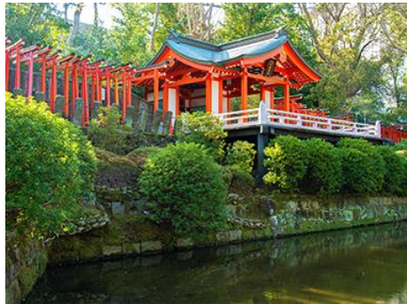
Nezu Shrine 根津神社