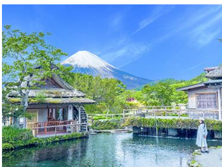
Oshino Hakkai 忍野八海